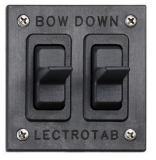
SAB-S Bat Handle Rocker Switch

Lectrotab's flat rocker switch has improved sealing to prevent water entry and recessed rocker to prevent breaking. Rocker switch controls are available in either flat or bat handle style. They are specially designed to provide and "instant stop" circuit when the switches are released, thus preventing actuator over-run. This control can be upgraded with an LED tab position indicator. The gasket sealed switch is designed to prevent water entry. The control switch is self-contained and does not require an additional control box. Switches are available for single or dual station applications.