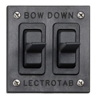
SAB-S Bat Handle Rocker Switch

Lectrotab's new flat rocker switch has improved sealing to prevent water entry and recessed rocker to prevent breaking. Rocker switch controls are available in either flat or bat handle style. They are specially designed to provide and "instant stop" circuit when the switches are released, thus preventing actuator over-run. This control can be upgraded with an LED tab position indicator. The gasket sealed switch is designed to prevent water entry. The control switch is self-contained and does not require an additional control box. Switches are available for single or dual station applications.