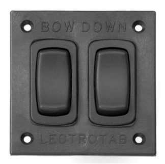
SAF-SC Flat Rocker Switch